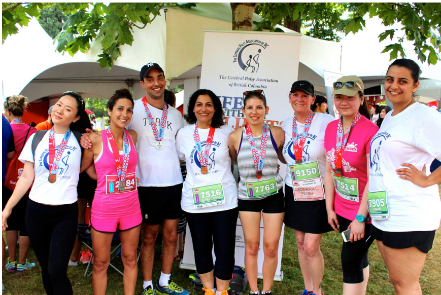
Staff, board members, members, and volunteers come together for the 2015 Scotiabank Charity Challenge.